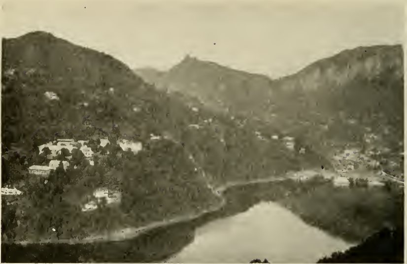
Wellesley High School (at left) on the mountainside, overlooking shining Naini Tal